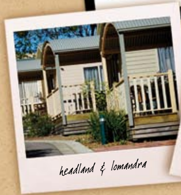
headland & lomandra