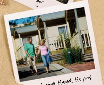
A stroll through the park