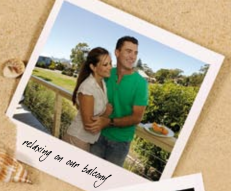
relaxing on our balcony