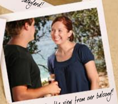
Enjoying the view from our balcony!