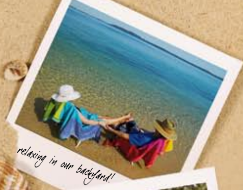
relaxing in our backyard!