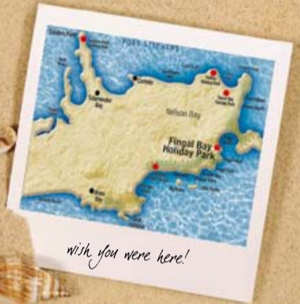
wish you were here!

52 Marine Drive, Fingal Bay NSW 2315 Freecall: 1800 600 203 Ph: +61 2 4981 1473 Fax: +61 2 4984 2227 fingalbay@beachsideholidays.com.au park rating AAA★★★★